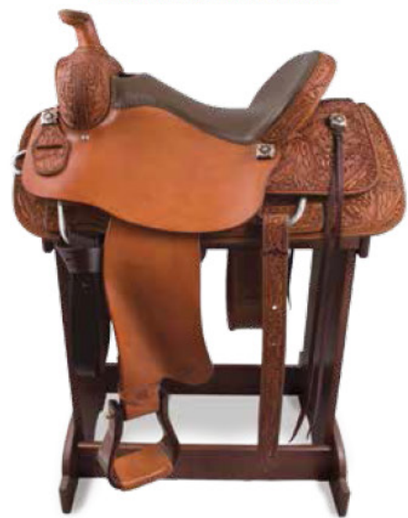
SORREL RIVER RANCH (TOP)