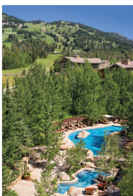
A view from Hotel Jackson, top, and from the Four Seasons Resort Jackson Hole, right. Hotel Jackson features a rooftop hot tub, and Four Seasons guests can kick back at the property's expansive spa.

Five years ago, a summertime stay in Teton Village, the community at the base of the Jackson Hole Mountain Resort, was what you did when you wanted peace and quiet. That's changed. You can still kick back inside the cowboy-chic Four Seasons Resort Jackson Hole ( fourseasons.com/jacksonhole ), especially at its 11,600-square-foot spa. But you can also find plenty of summer action: Steps from the 124-room/suite property's Base Camp are lift-serviced downhill mountain biking trails, hiking trails, free outdoor concerts, and a gondola ride to the valley's best margaritas. The only LEED-certified hotel in downtown,